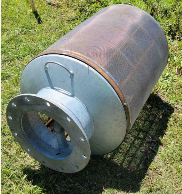
New intake screen awaiting installation