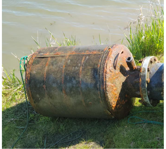
Replacing this one